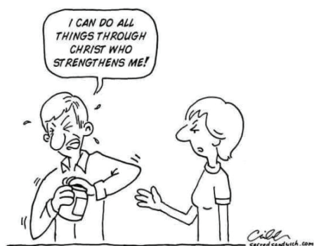
"It's a pickle jar, Tom... Twist the lid, not scripture."

"I follow with apprehension and pain what is happening in Israel... I express my solidarity with the families of the victims. I pray for all those who are living through hours of terror and anguish. May the attacks and the weapons cease, I beg you. Terrorism and war do not lead to a solution, but only to the death and suffering of many innocent people. Pope Francis